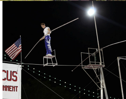
Victoria Circus Show